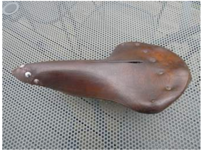
Before and after images of the saddle